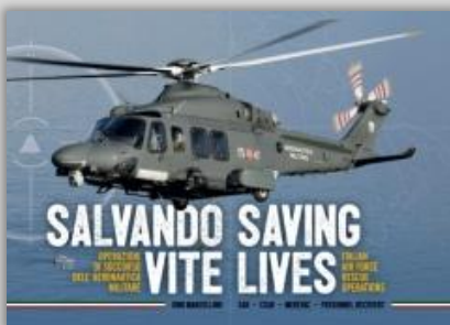
SALVANDO VITE 2018