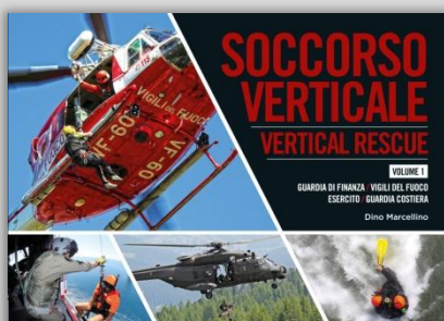
SOCCORSO VERTICALE VOL.1 2020