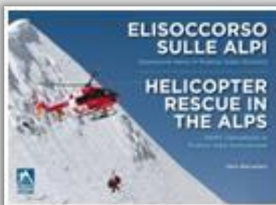
ELISOCCORSO SULLE ALPI 2015