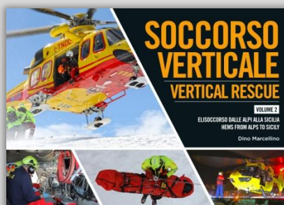
SOCCORSO VERTICALE VOL.2 2020