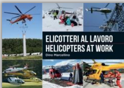
ELICOTTERI AL LAVORO 2017